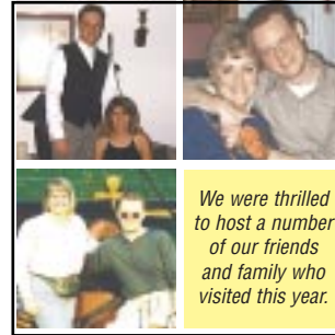
We were thrilled to host a number of our friends and family who visited this year.