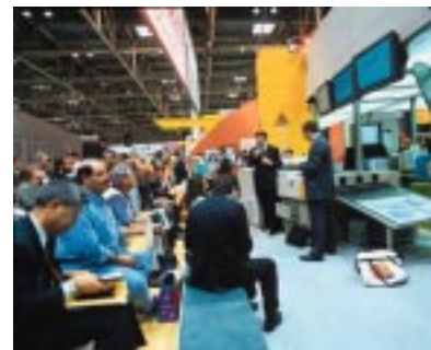
Excitement in Chicago: Print97! was a huge success. The Scitex booths were packed with prospects, customers, and journalists.

By September, the largest print show of the year was held in Chicago. Several months of planning and preparation led up to twelve days of sheer energy. The result was the most successful trade show for Scitex, with the entire industry taking notice and talking about the "New Scitex."