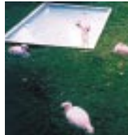
No, Marc didn't try to steal a flamingo.