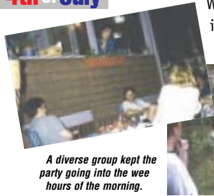
A diverse group kept the party going into the wee hours of the morning.