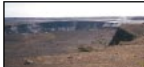
Left: the active volcano's crater, with steam rising. We hiked the perimeter. Right: in 1995, this road was blocked by a lava flow an eruption

Our agenda was simple: no structure, no timelines, just go with the flow, relax, enjoy. Our mission was accomplished, and we will definitely be going back— next time we're thinking about Maui.