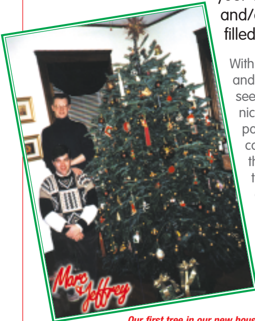
Our first tree in our new house— all 8 feet of it!

Greetings and warm wishes for the coming new year... and always.